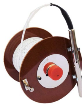
Water Level Meter on hand reel (up to 50m)

The high-precision-measuring-tapes are available with cm/mm markings or feet and 1/100th foot markings.