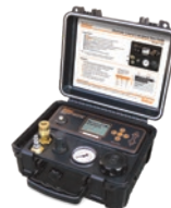
Model 464 Electronic Control Unit