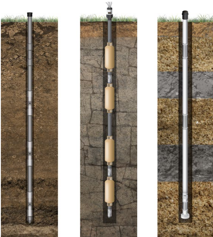
615ML Multilevel Drive-Point Piezometer

Saves Cost – through reduced permitting and drilling costs; and because narrow tubes allow smaller purge volumes, reduced disposal costs, efficient low flow sampling and rapid response to pressure changes, all reduce field time.