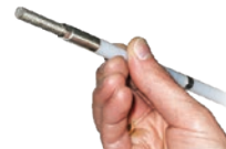
Model 408M DVP 3/8" (9.5 mm)