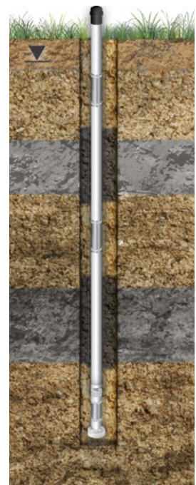
Typical 3 or 7-Channel CMT Installation using Layers of Bentonite and Sand Backfilled from Surface