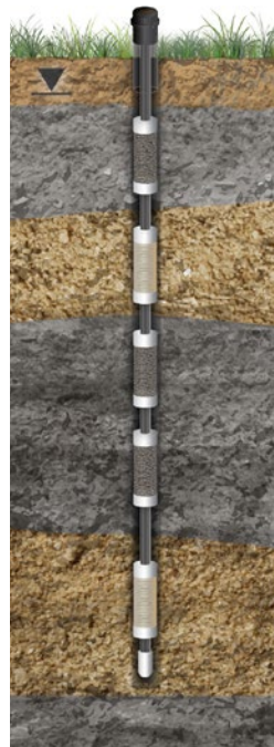
Typical 3-Channel CMT Installation in Overburden with Bentonite and Sand Cartridges