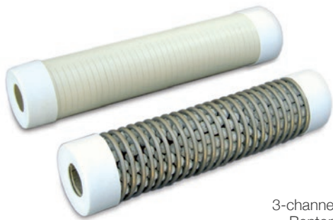
3-channel CMT Sand and Bentonite Cartridges

These cartridges are approximately 2.4" (61 mm) in diameter and will fit inside various direct push drill rods. Ideally, the borehole diameter these bentonite cartridges are used in should not exceed a nominal 3.5" (90 mm), to ensure proper expansion and sealing.