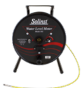
Model 102 Water Level Meter

Vapor Samples: A special Vapor Wellhead Assembly can be used to obtain depth discrete vapor samples.