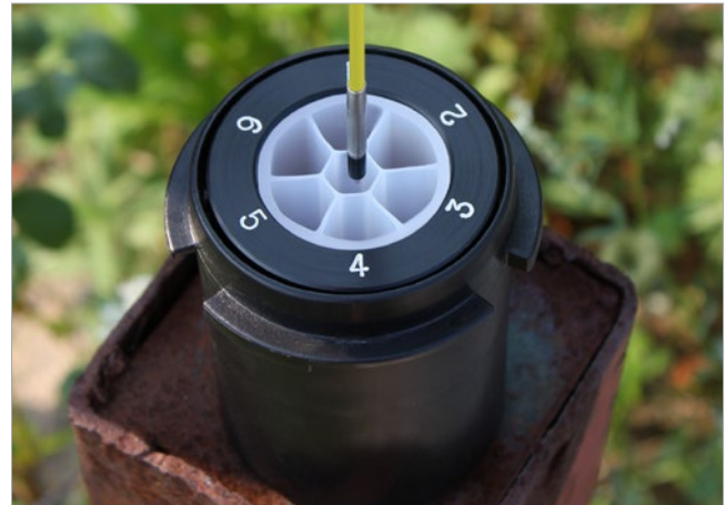
Measure Water Levels within the narrow channels of a Solinst CMT® System.

The 102M Mini Water Level Meter is available in 25 m and 80 ft. lengths. There is the choice of the P4 or P10 Probe.