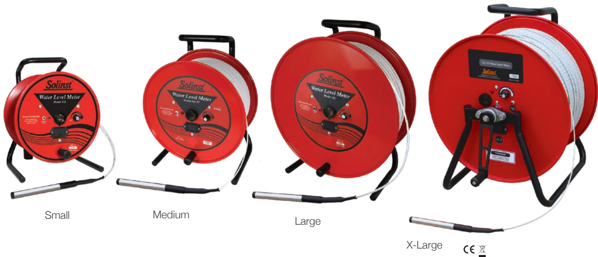
Model 101 Water Level Meter Reels