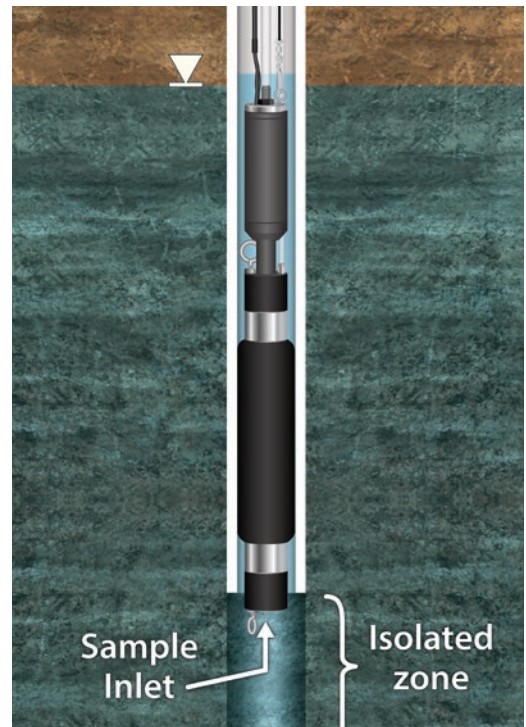
A Model 800M Packer can be used to isolate the sampling zone and reduce purge volumes.