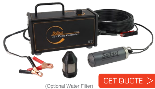
(Optional Water Filter)

Simply turn the dial on the 12V Pump Controller clockwise to increase the voltage to the Controller, which turns the Pump's motor faster and increases the flow rate.