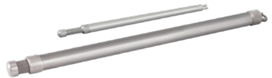
1.66" (42 mm) and 5/8" (16 mm) Diameter Stainless Steel Double Valve Pumps

The DVP is suitable for low flow or regular flow sampling. The stainless steel pumps can operate to depths of 150 m (500 ft).