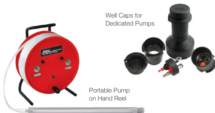
Well Caps for Dedicated Pumps