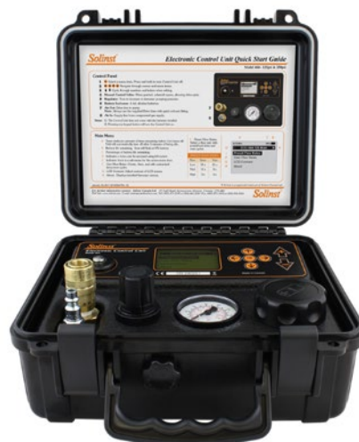
Model 464 Electronic Control Unit (125 psi and 250 psi Models)

The pump is quick to disassemble and the bladders and screens are simple to replace in the field. No tools required. Inexpensive polyethylene bladders can be quickly replaced to suit regulatory requirements.