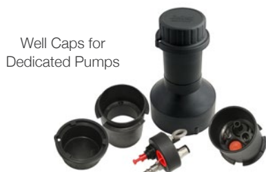
Well Caps for Dedicated Pumps

The caps slip easily onto 2" dia. (50 mm) wells. Adaptors to fit 4" dia. (100 mm) wells are also available. They have quick-connect fittings for the drive and sample tubing.