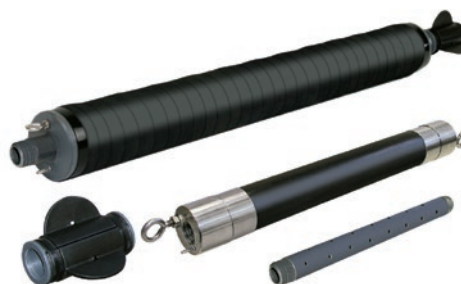
Model 800 Packers 3.9" and 1.8" (99 mm and 46 mm)

Model 800 Low-Pressure Packers can be used with Solinst Bladder Pumps to minimize purge times by reducing purge volumes. This reduces the cost of water disposal and labour. Packers are available in single point or straddle packer designs, and in sizes to fit 2" (50 mm) to 5" (127 mm) dia. wells. (See Model 800 Data Sheet.)