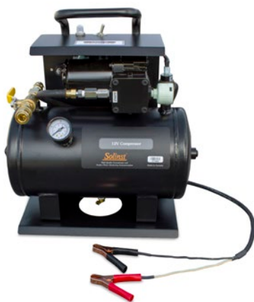
12 Volt Compressor

The compressor operates using 12 volt DC power source, such as a car or truck vehicle battery, and comes with alligator clips. The compressor operates at up to 150 psi and is equipped with a 2 US gallon (7.6 L) air tank which is rated to 175 psi.