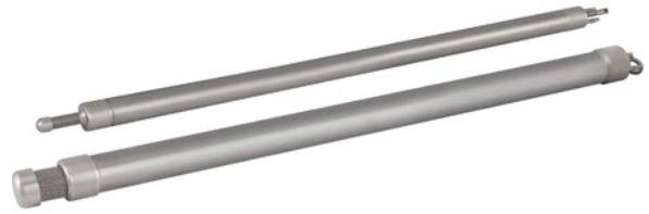
Solinst Bladder Pumps available in Stainless Steel 1" and 1.66" (25 mm and 42 mm).