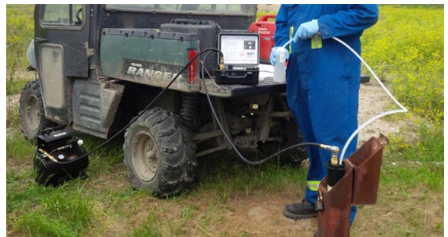
Sampling with a Dedicated Bladder Pump using Portable, Rugged, Easy-to-use, Compressor and Controller

For water level monitoring there is an access hole to fit a Solinst Model 101 Water Level Meter or Levelogger. An eyebolt is provided for a pump support cable or for suspension of a Solinst Levelogger, (see Model 3001 Data Sheet) or other device.