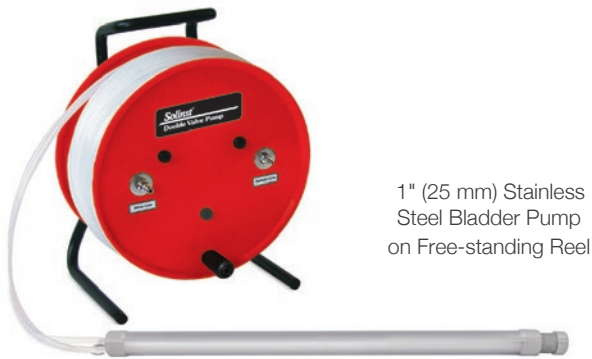
1" (25 mm) Stainless Steel Bladder Pump on Free-standing Reel

They are supplied on a free-standing reel. The rugged systems are very convenient and easy to transport. Tubing fittings on the reels and controller are compression fittings, allowing quick set up in the field. The Solinst Model 103 Tag Line can be used to lower and support the pump in the well (see Model 103 Data Sheet).