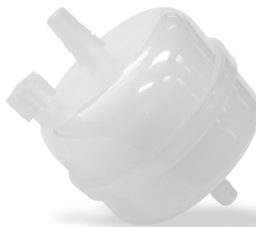
Model 860 Disposable Filter

Higher volumes are obtained with the use of electric or gasoline powered surface pumping mechanisms.