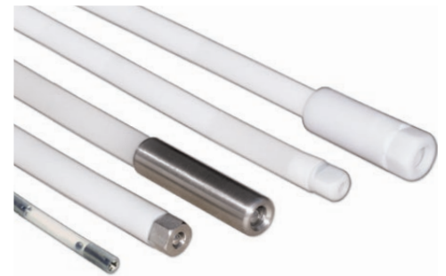
From left to right: Mini Inertial Pump, SS16, SS19, D16, and D25 Inertial Pumps