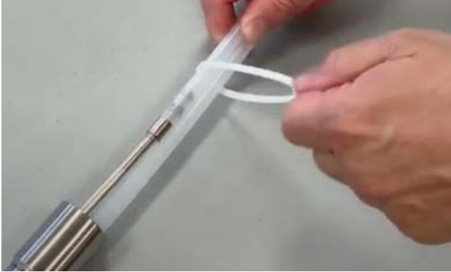
Use cable ties to bundle the tubing.