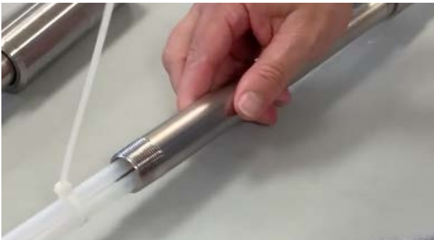
Push/move the cable tie along to keep tubing grouped and avoid twisting.