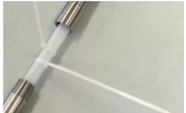
Cut and remove cable ties. Now slowly slide extension into place and tighten.