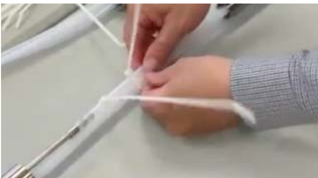
Keep tubing from twisting before adding extension.